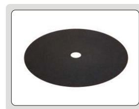
cutting blade MLP-50Z4 (included)